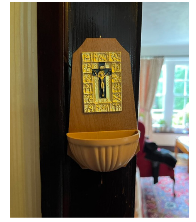
Roman Catholic holy water font.

We had just started – before COVID came we had started a Gospel sharing group midweek, on a Wednesday evening. And it meant coming to church. That was the way we thought, you know, meant coming to church. So you had about six regulars would be coming. And that had been going on for four, five months when COVID came. And that group said, no, we must carry on. We'll use Zoom. So suddenly Zoom was all the rage, wasn't it, you know. That only came in with COVID, really, you know, in any way. And they've kept it up on Zoom absolutely every week. It's the same group of people. But they have grown, you feel the growth within themselves. Exploring the Bible. I don't know, Catholics are atrocious for not reading the Bible. They do everything else, all these other holy prayers and things. They just don't read the Holy Scripture. They were never taught to. And these people are discovering Scripture and therefore discovering a living Jesus, if you like. And they're more engaged now - since the lockdown was lifted they're more engaged. They're more into – you feel the influence as well on the rest of the community. So many people learnt to pray at home. Which they wouldn't – may not have done before. And then this group, that really have moved on with the Gospel sharing.