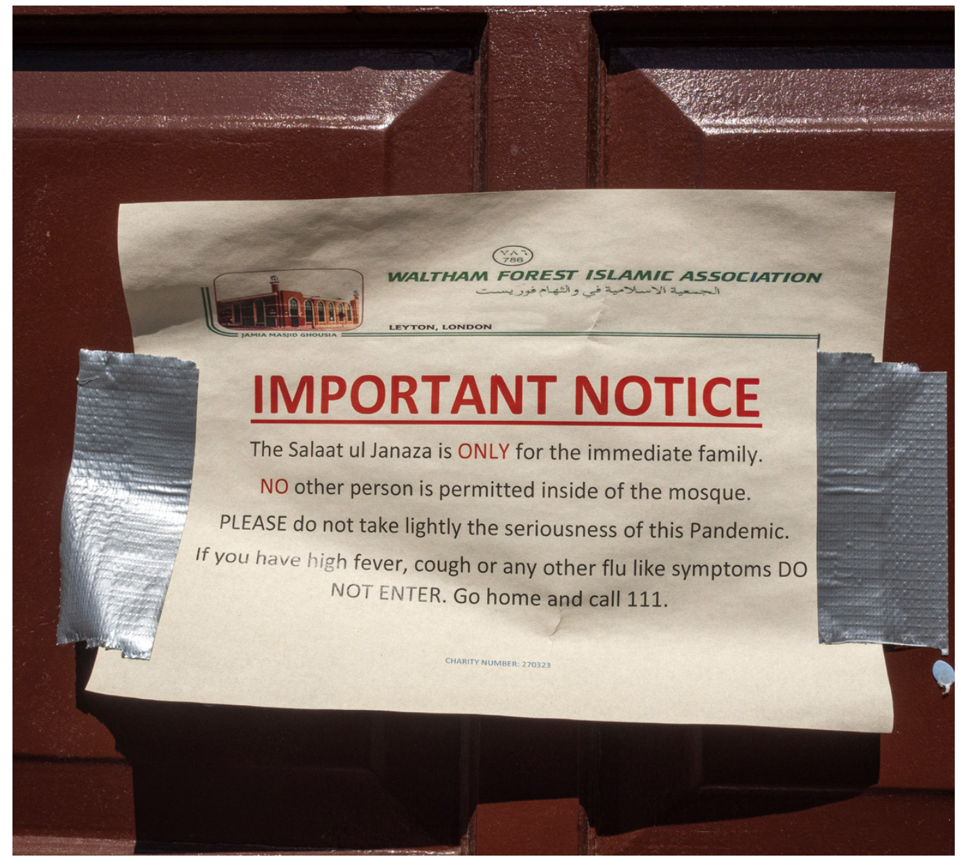
Marcos Casado Shutterstock 1720 Notice about funeral prayer