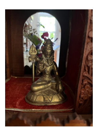
Sikh, Buddhist, Roman Catholic and Hindu faith symbols.